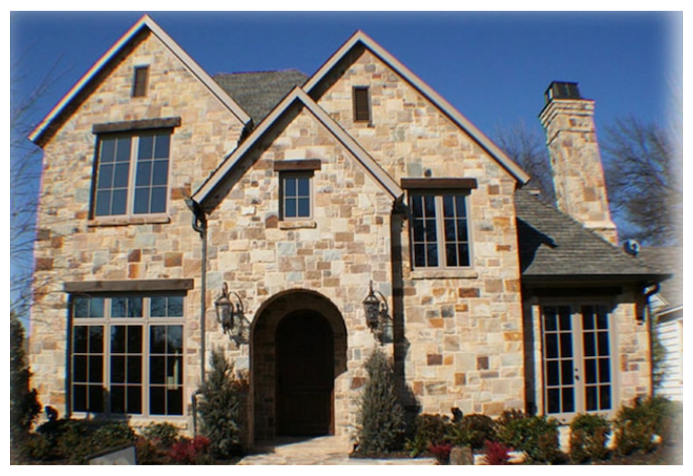
Dallas-based Alexander Hunt Distinct Homes currently builds custom houses in North Dallas.